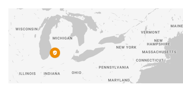
Holmbergs Safety System Inc. Warehousing | Sales | Engineering