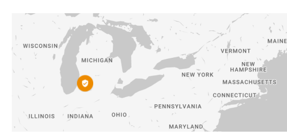
Holmbergs Safety System Inc. Warehousing | Sales | Engineering